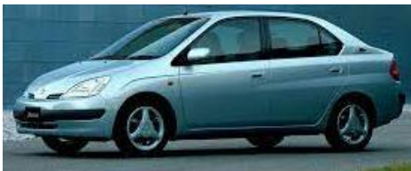
First Toyota Prius