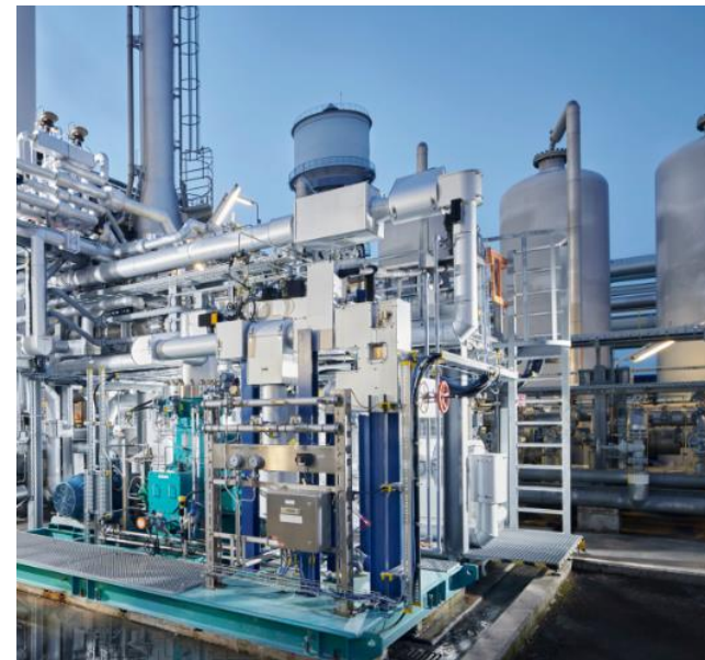
Linde's hydrogen plant