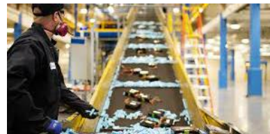
Li-Cycle recycling facilities

For illustrative purposes only. Company examples are for illustrative purposes only. This does not constitute investment research or financial analysis relating to transactions in financial instruments, nor does it constitute an offer to buy or sell any investments, products or services, and should not be considered as solicitation or investment, legal or tax advice, a recommendation for an investment strategy or a personalised recommendation to buy or sell securities.